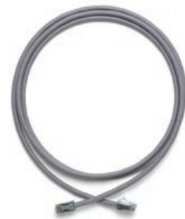
G10FP Patch Cord