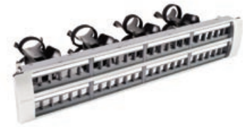
SYSTIMAX 360 GigaSPEED X10D Modular Panel, 48 Port, Front View