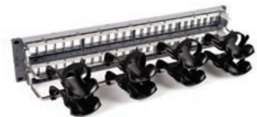
SYSTIMAX 360 GigaSPEED X10D Modular Panel, 48 Port, Rear View