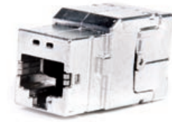
SYSTIMAX GigaSPEED X10D Shielded High Density Information Outlet

When used with the SYSTIMAX GigaSPEED X10D F/UTP modular panels, cable length is dramatically reduced in a channel configuration. CommScope engineers pushed the threshold and reduced the original 15 meter cable length requirement to 5 meters for 3 or 4 connector channels and only 3 meters for 2 connector channels - a more than 65 percent reduction in short channel length. These new short cable requirements give CommScope customers the design freedom to build a Category 6A infrastructure that meets their needs without the hassles of inefficient spacing and slack storage.